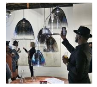
Beacon Lighting-Custom lighting solutions for Designers, Architects & Hospitality. Honoring Bohemian legacy and moving tradition forward is in their DNA.

S.O.B-Será o Benedito is brand with a distinctive concept. S.O.B. is the first Brazilian sustainable and ethical fashion and home accessories brand.