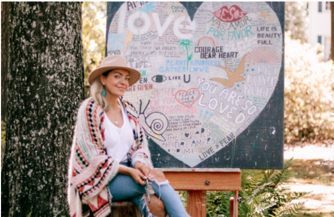
Sugarboo & Co. | G-2000 wholesale.sugarbooandco.com