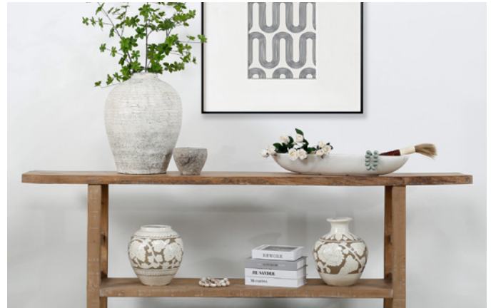
Lily's Living Inc | G-1028 lilysliving.com

Kalalou is a leading supplier of the most fascinating products to be found in the home accents, garden, and gift arenas. For 36 years we have traveled the lesser-known corners of the world in an effort to bring fresh ideas, unique materials, and true artisan marvels to the marketplace in a way few others can match! We invite you now to please review the most exciting offering in our company's history. We really think you'll be glad that you did!