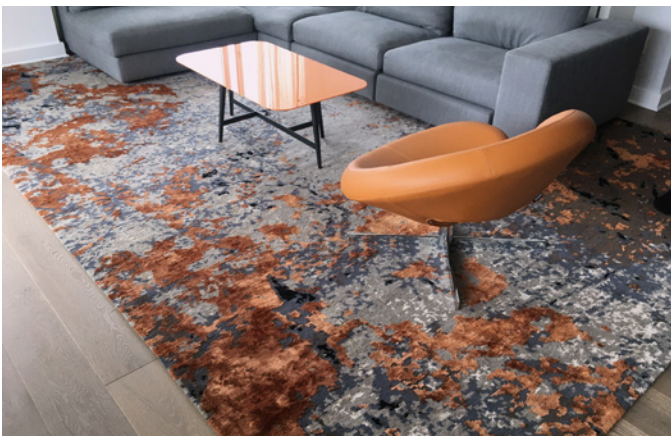
MASTOUR CO | G-3039 mastourgalleries.com

Lily's Living is where arts intersect lifestyle. A palette of soft and subtle colors with a mix of weathered and distressed finishes brings you a one-of-a-kind product to create coastal, organic, earthy, romantic living spaces.