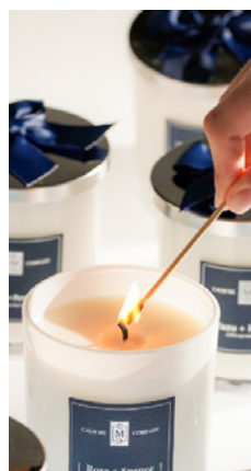
Calm Me Company | M-5025 calmmecompany.com

At BedFlix TV Lift Furniture, our commitment lies in crafting the finest TV beds available, setting the standard for quality and design. With a diverse selection of striking designs, ranging from modern to traditional styles, each TV bed is meticulously constructed to the highest standards and conveniently delivered to your doorstep. Every bed is tailor-made to suit your preferences, offering a choice of size, style, and finish.