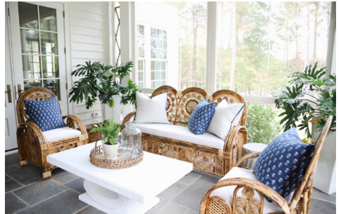
Varnish Collection | M-6049 varnishcollection.com