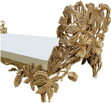
Jo-Liza International | G-705 | SALON joliza.com