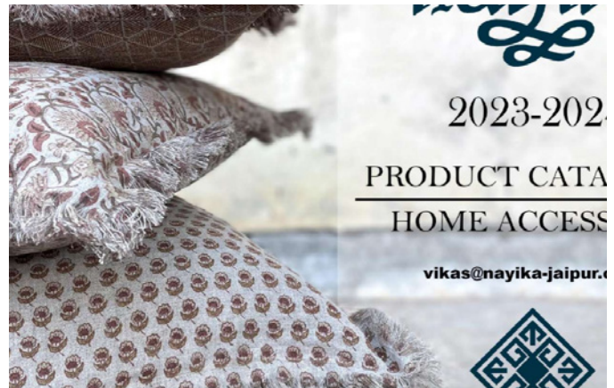
Nayika | M-2022A nayikajaipur.com

Mountain House Furniture is a family-owned enterprise offering quality and elite residential and commercial patio furnishings. Infused with luxury, their pieces transform spaces with sophistication. Committed to excellence, their world-class customer service solidifies their status as industry leaders in outdoor furniture.