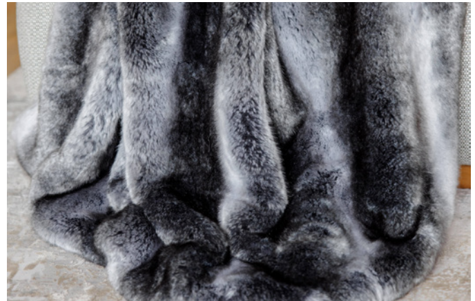
Fabulous Furs | M-5037 wholesale.fabulousfurs.com

Rugs are made to order in any color, shape, or size in our Birmingham-based design studio. We produce original designs in modern oushak, flatweave, jute, indoor/outdoor, and a host of natural fibers. Our wool is 100% New Zealand wool and all rugs are hand-knotted by generationally trained artisans.