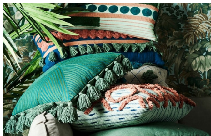
Condor | M-2022 condor.co.in

Since 1974, Chesterfield Leather has been an industry hallmark as a leading wholesale and retail distributor of cowhides and sheepskin products. For three generations we have traveled the world sourcing the very best and most beautiful products.