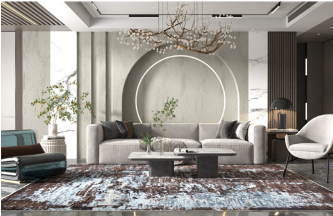
Olker Rugs | M-1021 olkerrugs.com

Experience the Timeless Elegance of Olker Rugs - Crafting heirloom quality rugs for four decades, we blend tradition with innovation. Our award-winning designs, handwoven using eco-friendly practices, reflect both classic and modern aesthetics. Each rug passes through skilled hands, ensuring unsurpassed quality. Discover custom options from 1' x 1' to 20' x 50', perfect for interior designers.