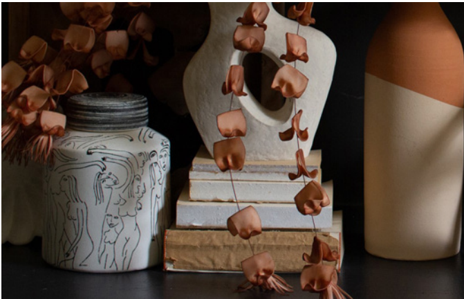
KALALOU | M-2003 kalalou.com

Kalalou is a leading supplier of the most fascinating products to be found in the home accents, garden, and gift arenas. For 36 years we have traveled the lesser-known corners of the world in an effort to bring fresh ideas, unique materials, and true artisan marvels to the marketplace in a way few others can match! We invite you now to please review the most exciting offering in our company's history. We really think you'll be glad that you did!