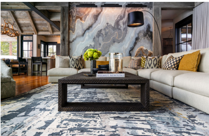
New Moon Rugs | G-4029 newmoonrugs.com

Home textiles made using age old sustainable technique of Hand Block Printing. All products we make are hand made.