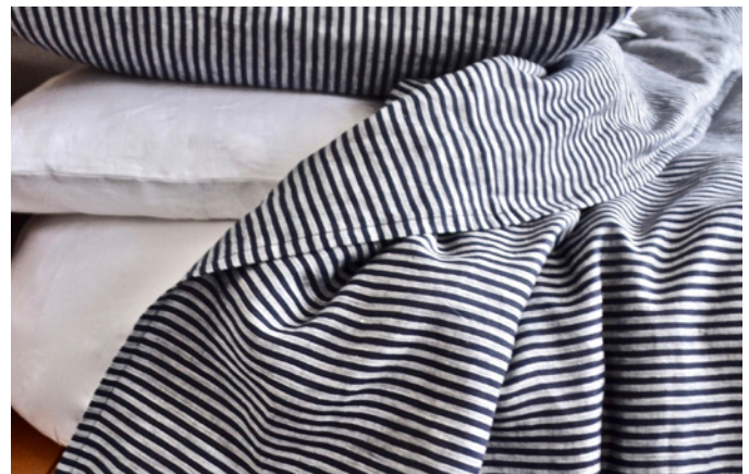
Modernplum | M-6043 modernplumhome.com

Exquisite Hand Woven designer rugs . Award winning designs. We cater to High End designers and Architects & Luxury Hotels and Resorts around the world. All rugs are in stock for immediate delivery. Custom projects welcome.