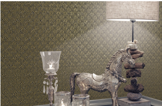
Galerie Wallcoverings LLC | M-5026 galerieinteriordesign.com

For over 30 years Fabulous-Furs has been at the forefront of innovation in the faux-fur industry. As an ever-evolving brand, we devote everything we do to bringing you the most luxurious collection of trending styles available - all with a reputation for quality and commitment to cruelty free fashion that has become synonymous with Fabulous-Furs.