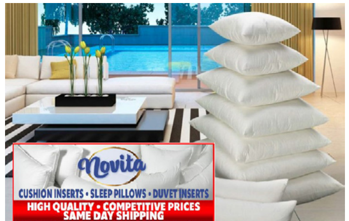
Novita Home Furnishings, Inc. | M-4026 novita.us

There are few things left in the world that are created as part of a living supply chain touched by human hands every step of the process. A New Moon rug is one of those things. Second generation and family-owned, New Moon set the standard for creative innovation and ethical production in Nepal over 30 years ago. Rooted in fine art, our hand-knotted rugs create a beautiful foundation to any space and will endure for years, even generations, to come.