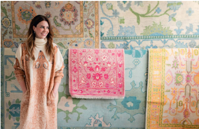
English Village Lane | M-6049A englishvillagelane.com

Rugs are made to order in any color, shape, or size in our Birmingham-based design studio. We produce original designs in modern oushak, flatweave, jute, indoor/outdoor, and a host of natural fibers. Our wool is 100% New Zealand wool and all rugs are hand-knotted by generationally trained artisans.