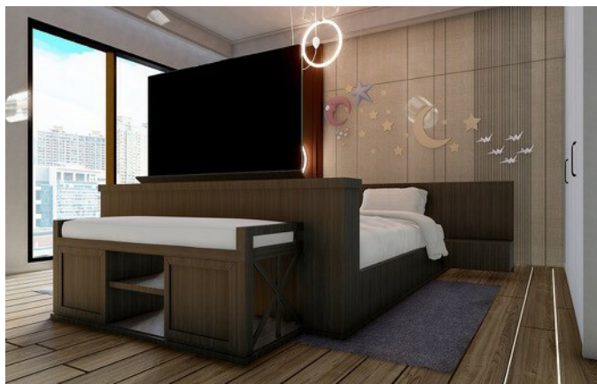
Bedflix | M-8002 bedflix.ca

At BedFlix TV Lift Furniture, our commitment lies in crafting the finest TV beds available, setting the standard for quality and design. With a diverse selection of striking designs, ranging from modern to traditional styles, each TV bed is meticulously constructed to the highest standards and conveniently delivered to your doorstep. Every bed is tailor-made to suit your preferences, offering a choice of size, style, and finish.