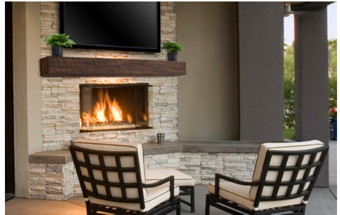
Pearl Mantels | M-7024 pearlmantels.com

Experience the Timeless Elegance of Olker Rugs - Crafting heirloom quality rugs for four decades, we blend tradition with innovation. Our award-winning designs, handwoven using eco-friendly practices, reflect both classic and modern aesthetics. Each rug passes through skilled hands, ensuring unsurpassed quality. Discover custom options from 1' x 1' to 20' x 50', perfect for interior designers.