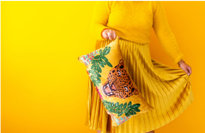
Post House | M-6045 posthousedesign.com

Established in 1995, Pearl Mantels is a leading manufacturer of fine furniture quality fireplace mantel surrounds and mantel shelves that include Non-combustible, Wood, MDF and adjustable designs. Whether your needs are for the home or for commercial use, we've got you covered. Pick a Pearl!