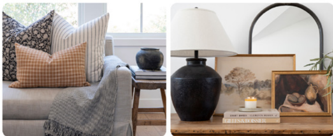
Linen + Cloth | G-6051 | SALON linenandcloth.com