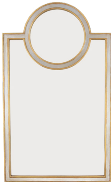
Zeugma Import | G-2001 zeugmaimport.com

Varnish Collection is a women owned furniture and design accessories line celebrating artisanal craftsmanship, thoughtful interiors, and personality pieces for the home. These sisters from Georgia are thrilled to offer these pieces as a work of art and furniture to be passed down through generations. Each piece is carefully handcrafted in the West Bengal region of India using both their designs and designs adopted from artisans in the region.