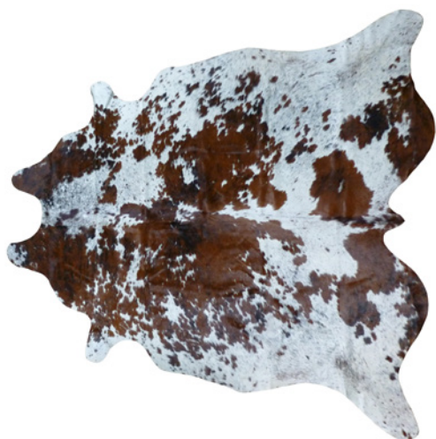
Chesterfield Leather | G-3018 chesterfieldleather.com

Since 1974, Chesterfield Leather has been an industry hallmark as a leading wholesale and retail distributor of cowhides and sheepskin products. For three generations we have traveled the world sourcing the very best and most beautiful products.