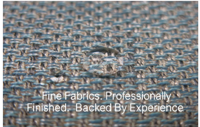
ProSeal Plus | M-5028 Prosealplus.com

As an interior and lifestyle design house, we work with artists around the world to create a collection of pillows, fabrics, wallcoverings, and carpets that pair unexpected traditionalism with eclecticism.