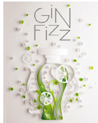
Lubin Paris | G-6002 | SALON lubin.eu

Linen + Cloth is a family-owned company in Northern California. We specialize in designer pillows handcrafted from curated fabrics, all proudly made in the USA. Over time our business naturally evolved, and we expanded to include a thoughtfully curated assortment of framed vintage reproduction art. Linen + Cloth was born from a combination of careers in interior design, real estate, and staging as well as the constant need to find pillows and art but never being able to find exactly what we were looking for. Our mission remains to create beautiful things that make any space feel like home.