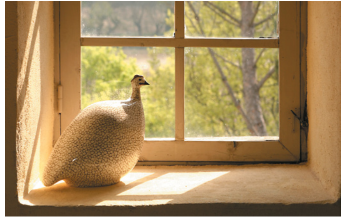
Les Ceramiques de Lussan | G-7008 | SALON pro.usa.ceramique-de-lussan.fr