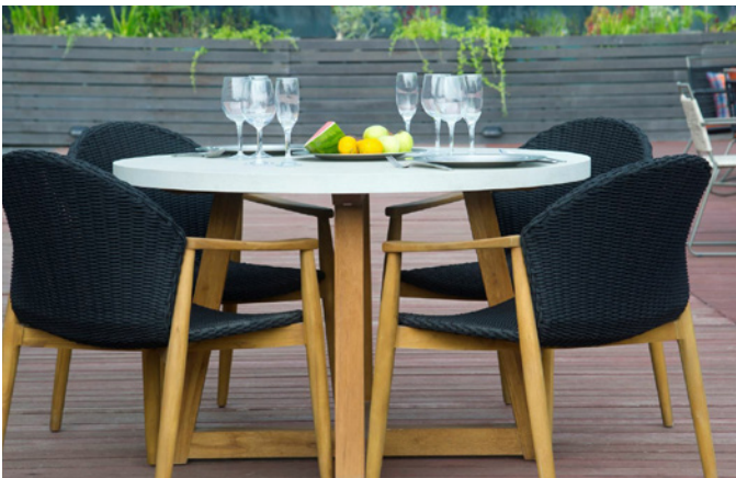
Mountain House Furniture | M-1015 mountainhousefurniture.com

Mountain House Furniture is a family-owned enterprise offering quality and elite residential and commercial patio furnishings. Infused with luxury, their pieces transform spaces with sophistication. Committed to excellence, their world-class customer service solidifies their status as industry leaders in outdoor furniture.