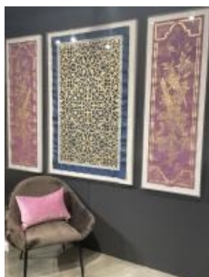
Pretty in pink - Cockatoos in 20 x 60, Center is 48 x 60