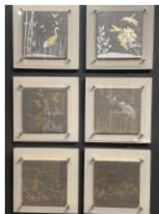
Six selections from our beautiful our Scenic Series