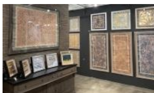
Come and see us in High Point! Remember all of our art is customizable - color, size, pattern!! You choose!