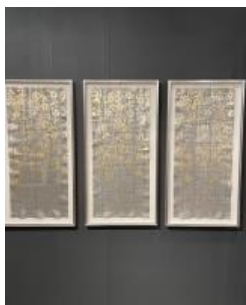
Floral Cascade Tryptych 24 x 48