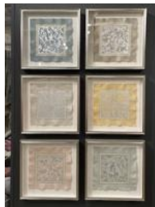
A grid of 6x 18x18 Birds and Blossoms