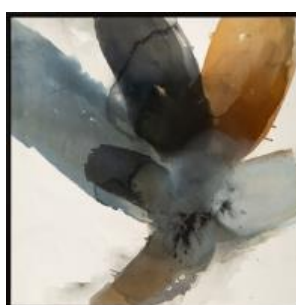
"Stargazer" is a giclée on canvas hand-coated with resin of an original painting by new Yoffi Art artist John Ross. It is available as a gallery wrap in small, medium and large sizes as well as framed H: 51" x W: 51" x D: 2"