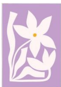
"Evgenia" is a hand-varnished giclée on canvas of an original work by new Yoffi Art artist Happy Hemera. It is available as a gallery-wrapped canvas in small, medium and large sizes or a floater frame H: 41" x W: 29" x D: 2"