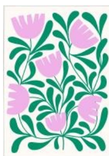
"Secret Garden" is a hand-varnished giclée on canvas of an original work by new Yoffi Art artist Happy Hemera. It is available as a gallery-wrapped canvas in small, medium and large sizes and framed. H: 41" x W: 29" x D: 2"