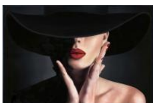
"Veiled Intentions" is a hand-embellished giclée on canvas of an original painting from RFA Decor's MOD Collection of moderately priced art. It is 45 x 67 inches, framed. H: 45" x W: 67" x D: 2"