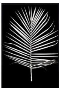
"Majesty Palm 2" is a hand-varnished giclée on canvas of an original botanical print by new Yoffi Art artist Eric Linton. It is available as a gallery wrap or framed in small, medium and large sizes. H: 41" x W: 27" x D: 2"