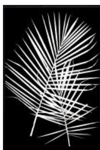
"Majesty Palm 1" is a hand-varnished giclée on canvas of an original botanical print by new Yoffi Art artist Eric Linton. It is available as a gallery wrap or framed in small, medium and large sizes. H: 41" x W: 27" x D: 2"