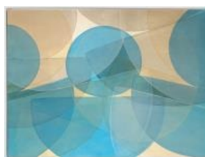
"Spotlight" is a hand-embellished giclée on canvas of an original painting by new RFA Decor artist Laura Dargan. It is 55 x 73 inches, framed. H: 55" x W: 73" x D: 2"