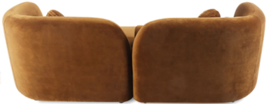
Tom Collins Home