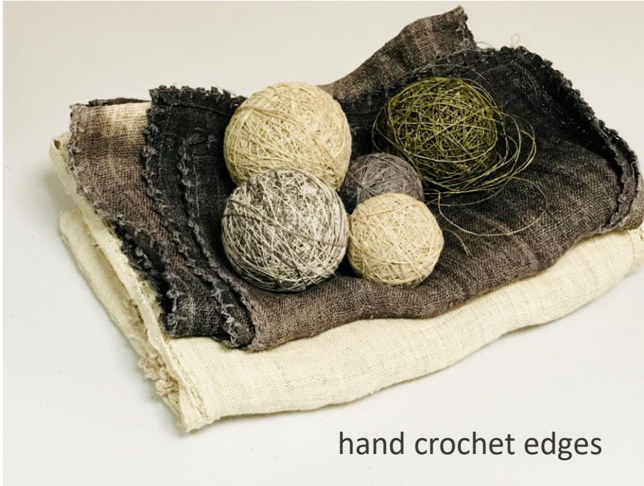
hand crochet edges