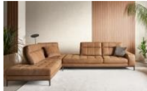
Hollywood: Corner Sofa Unit with adjustable backrests. New Collection Franco Ferri Italia 2024/2025