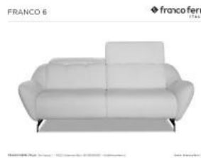
FRANCO6: NEW MOTION SOFA!! Zero Gravity Dual Motion