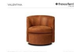
Valentina: New Swivel chair