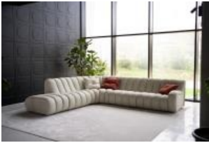
Scervino: New Corner Sofa Collection Franco Ferri Italia 2024/2025