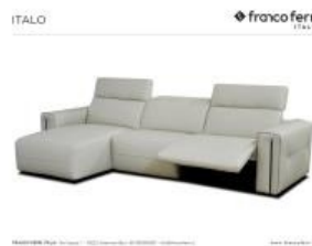
Italo: New Modular Motion Sofa!!