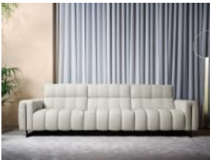
Genesi: Best Seller! Motion Sofa with adjustable headrests