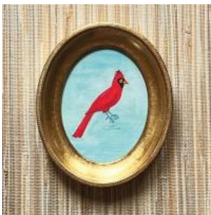
'Cardinal' H: 7" x W: 5" x D: 1"