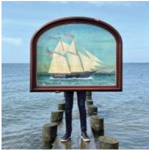
The Ship 'Newport' H: 48" x W: 60" x D: 5"