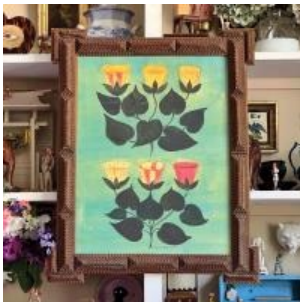
'Bell Flowers' H: 23" x W: 19" x D: 2"