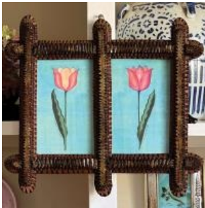
'Pink Tulips' H: 11" x W: 10" x D: 1"