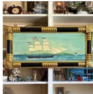
The Ship 'Tuckernuck' H: 15" x W: 31" x D: 3"