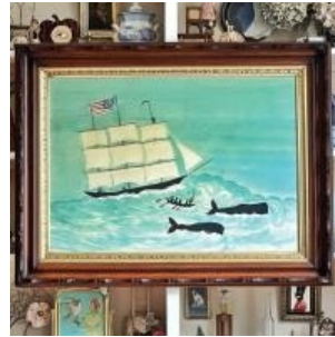
'Whaling Scene' H: 30" x W: 39" x D: 3"