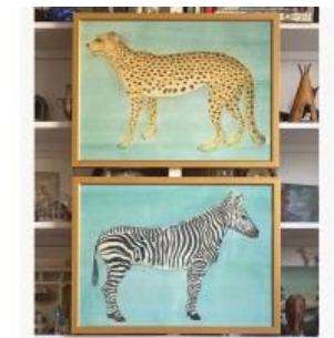
'Zebra' and 'Cheetah' H: 20" x W: 25" x D: 1"