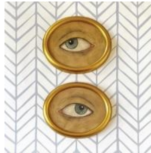
'Lover's Eye' H: 10" x W: 12" x D: 1"