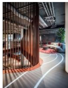
Neptune Energy - Corques Liquid Lino- Casper Schwarz architects