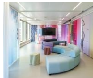
CBRE - Duracem Concrete Design Floors - CBRE Design