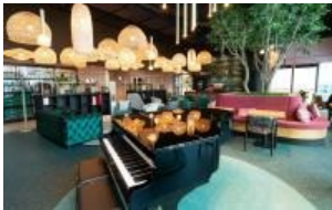
Zuiderhof II Amsterdam - Durabella Seamless Terrazzo - Architect: First Lines Design & Build