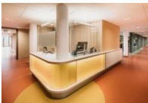
Amersfoort - Ndurance Liquid Rubber - Meander Medical Center