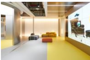
KB Securities - Corques Liquid Lino - JUNG In Design