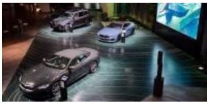
BMW World Munich - Architect: Patricia Urquiola - Durabella Seamless Terrazzo