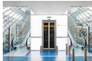
Schiphol Airport - Durabella Seamless Terrazzo - KLM ICA Lounge