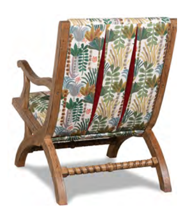
Old Town Reading Chairs These curved-arm chairs feature a painterly Key West print with a Paris-inspired peek-a-boo back.