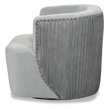
Tortuga Swivel Chairs Exquisite pleating, a la couture, adorn these chic and comfortable chairs.

With a distinctive square tufting pattern, this stylish Chesterfield is trimmed with an exotic South American hardwood, Bocote.