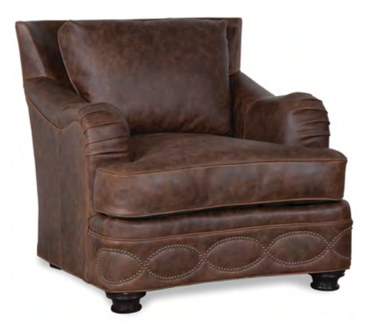
Whitehead Chair and Ottoman Generous scale, slight barrel back, and padded English arms accommodate with comfort. Matching ottoman completes the look.