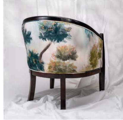
Dining chair : Hand painted illustration printed on velvet fabric