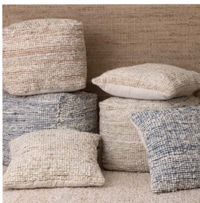
Savannah Collection : Handwoven jute blended with wool rugs with matching pillows & poufs.