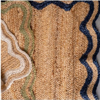
Scallop collection : Uniquely shaped jute rugs with colorful borders.