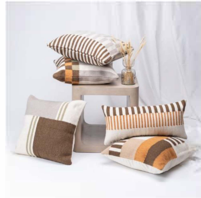
Bauhaus collection : Woven striped pillows in earthy colors.