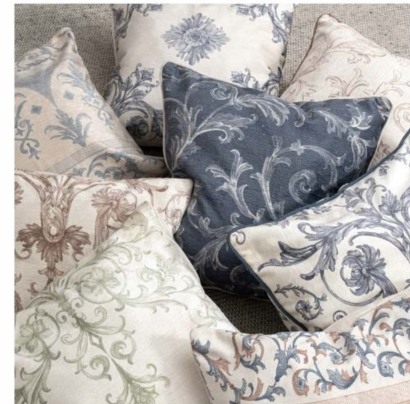
Roccoco collection : Printed pillows inspired by Roccoco style.