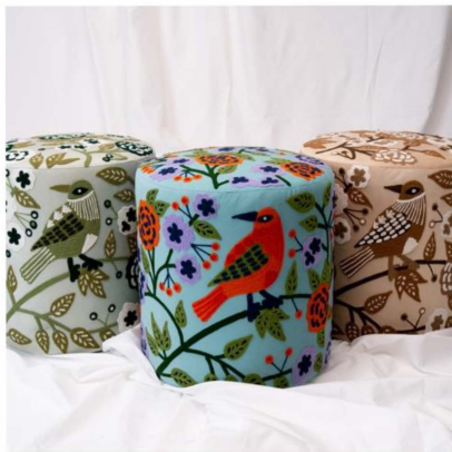
Ottomans to perfectly match our accent chairs. Adorned with embroidery.