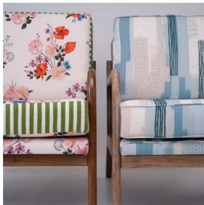
Accent chairs : Modern printed patterns. Wooden frames.