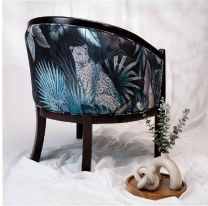
Dining chair : Hand painted illustration printed on velvet fabric